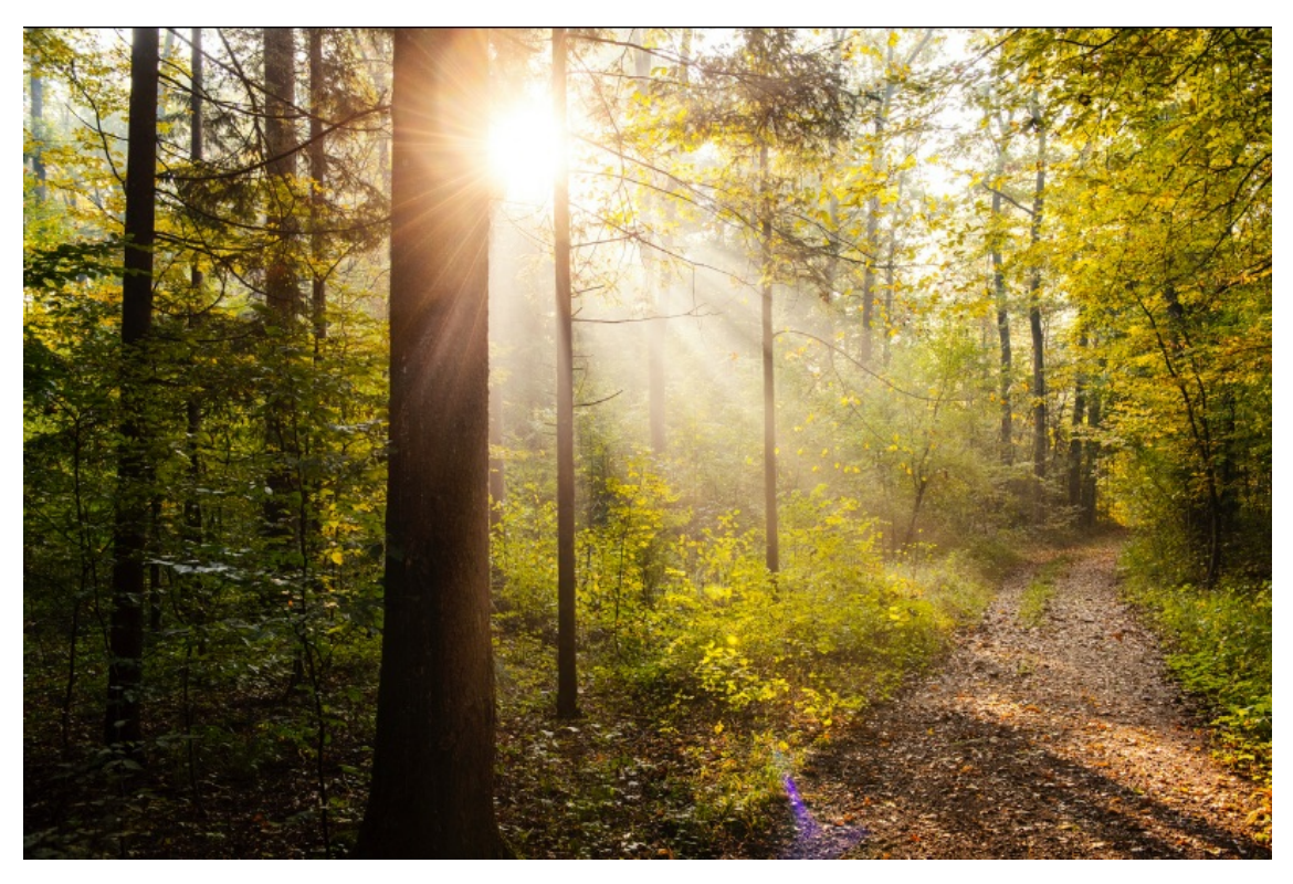
A Path to the Kingdom

"The beautiful thing about salvation is that God continues to provide a path for us to the